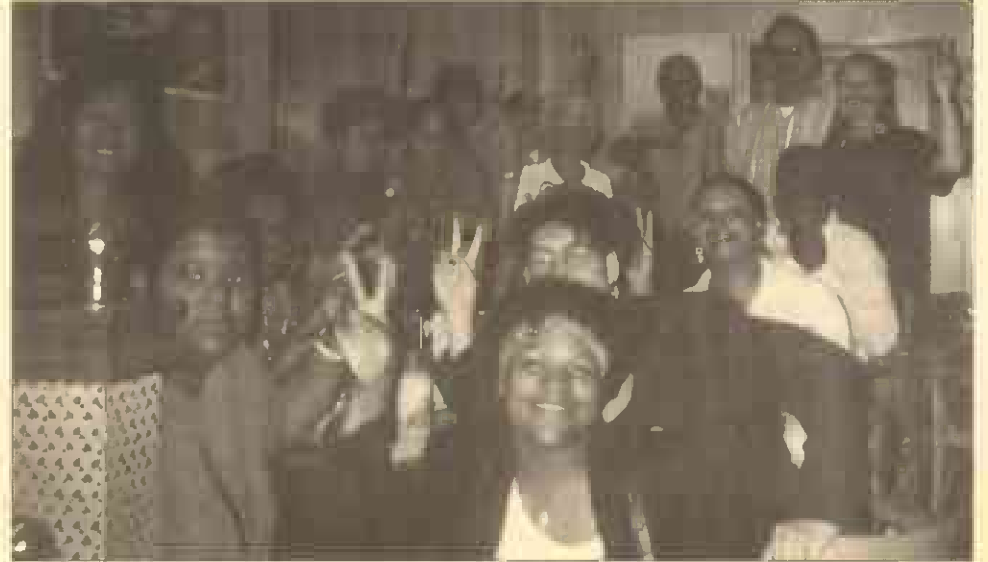
The new members of OPEIU Local 8 at the Seattle Housing Authority celebrate their organizing victory.

The perseverance of a large, repre-(Continued on page 7)