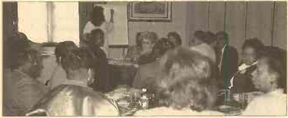
Northeast Conference: Beginning Organizing Class.