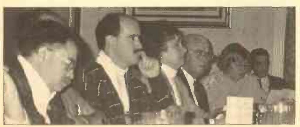
At Boston's Northeast Conference, participants contemplate the concept of sexual harassment.

Delegates were energized to begin new campaigns and shared readily with each other their experiences of what works and what doesn't.